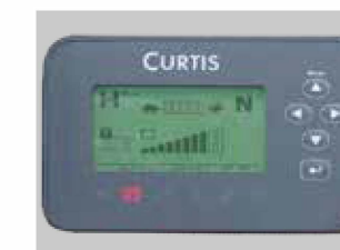
Big LED display.