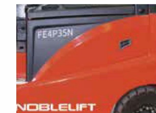
Graceful arc design.