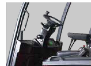
Excellent ergonomic design.

Operation sequence protection and electronic self-protection function, Emergency power off switch as standard configuration, meets the European safety norms.