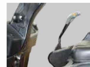
Hydraulic operating handle on the right side.