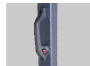
Rear hand holder with horn function. (Optional)