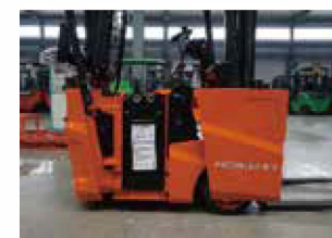
Battery compartment with rollers for 08-12N.

Variable wheelbase design: Mast tilting function realised through the movement of front axle.